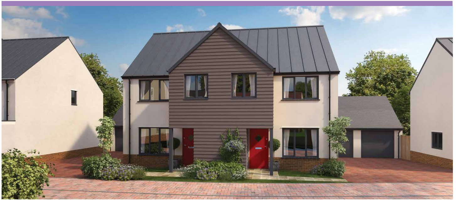
Typical CGI, not site specific.