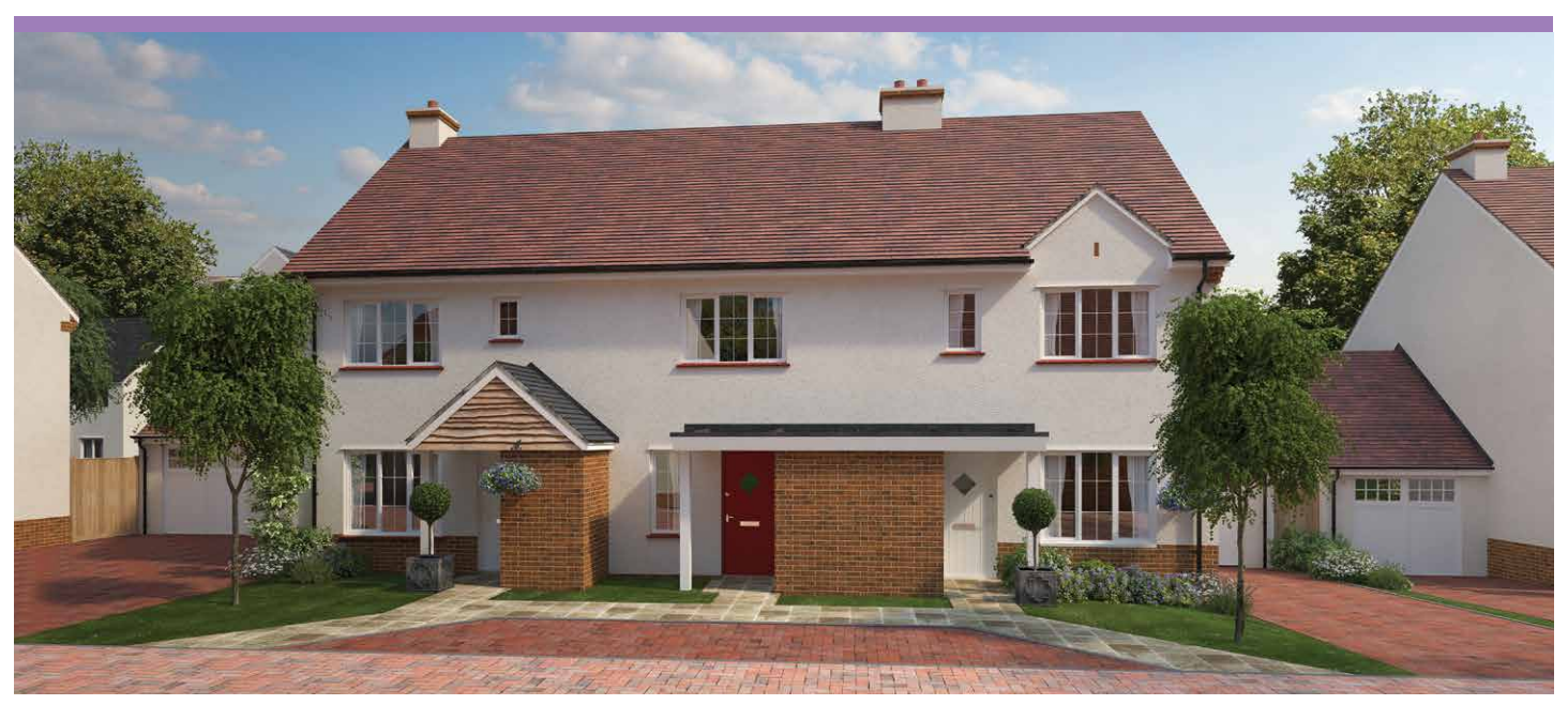
Typical CGI, not site specific.