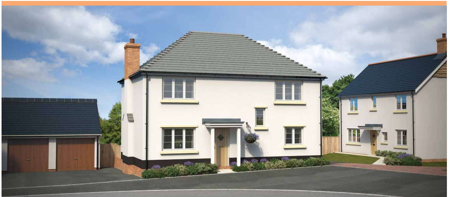
CGI shows plot 43