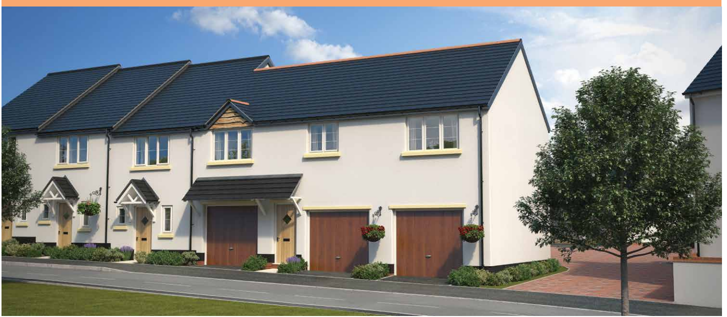
CGI shows plot 70