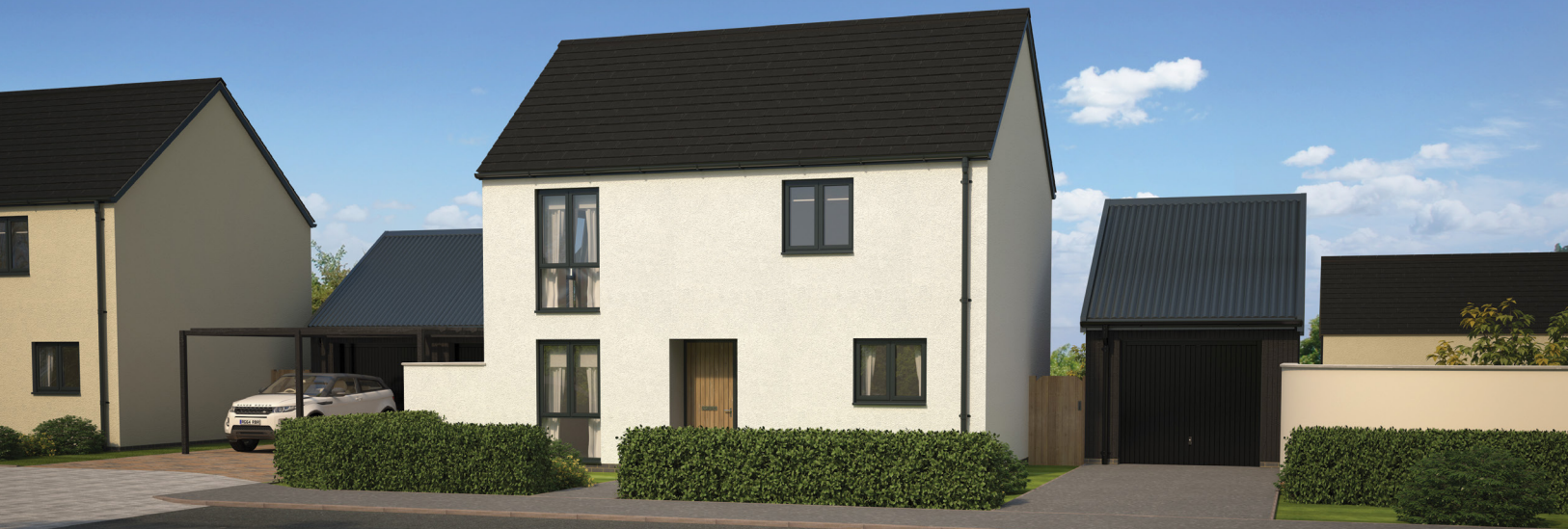
CGI shows Plot 10