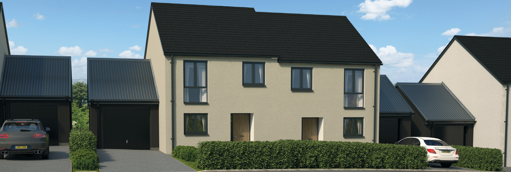
CGI shows Plots 52 & 53