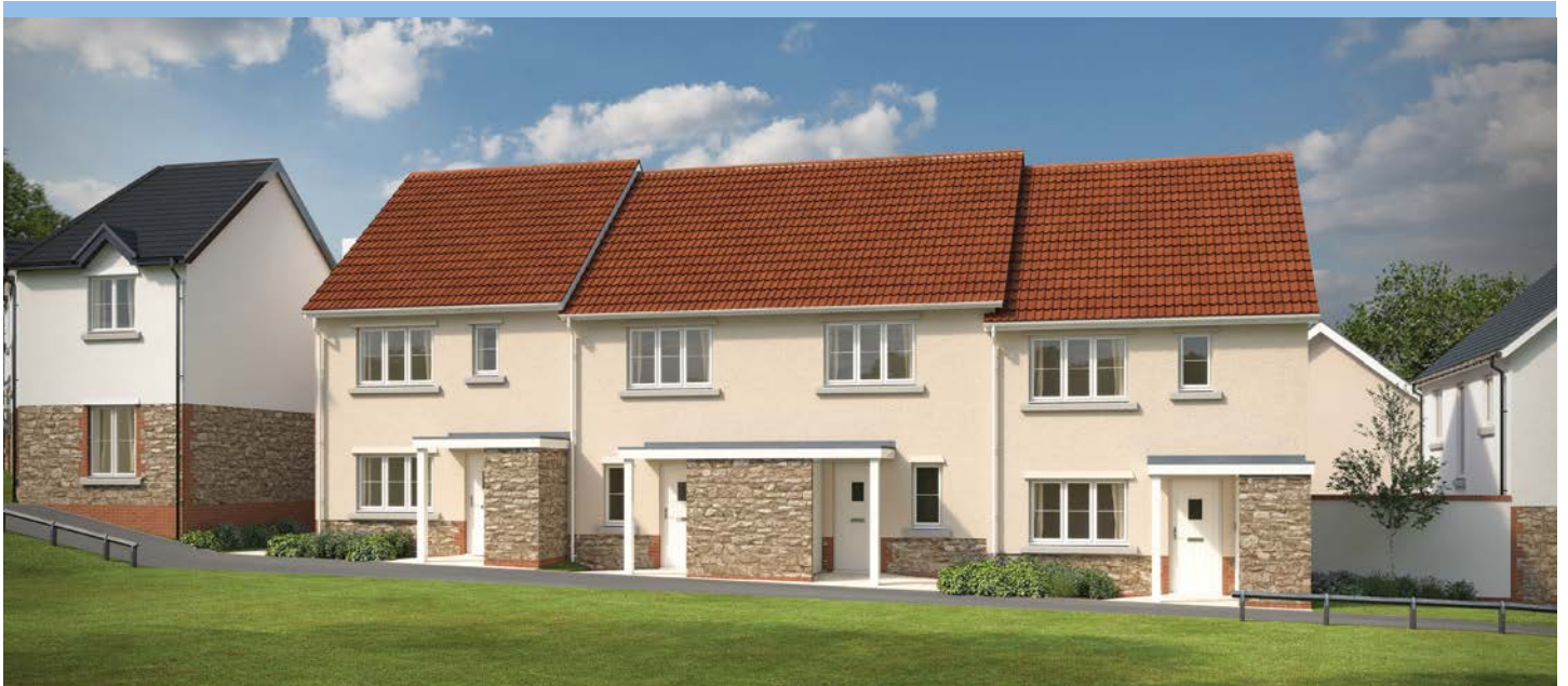
Typical CGI, not site specific.