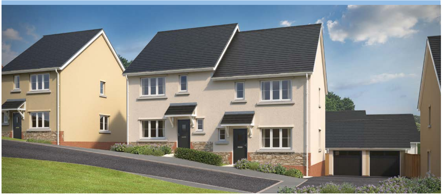
Typical CGI, not site specific.