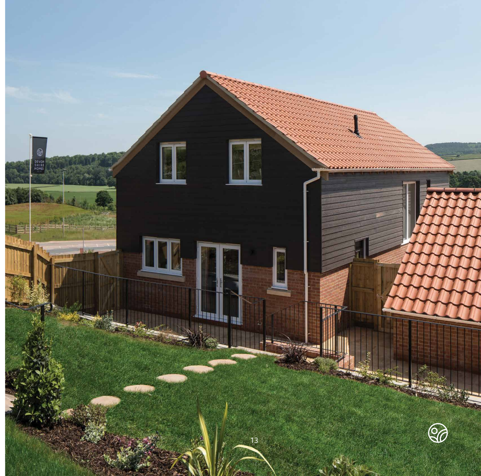
RIGHT Morchard at our Tarka View development in Crediton