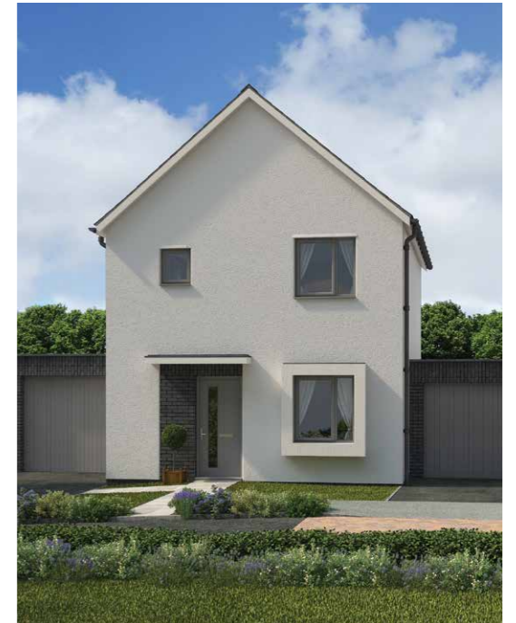
LEFT Gwallon and Sanderson ABOVE Keas

Gwallon takes its name from a large granite stone (menhir) that stands in the grounds of the local school.