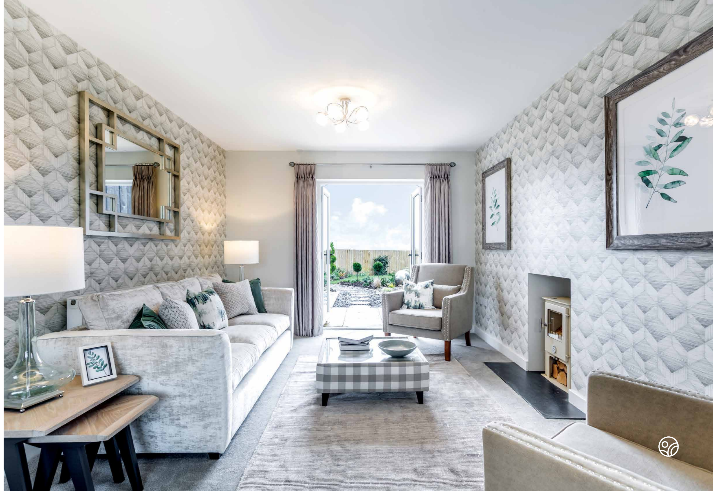
ABOVE & RIGHT Typical Devonshire Homes interiors — not site specific