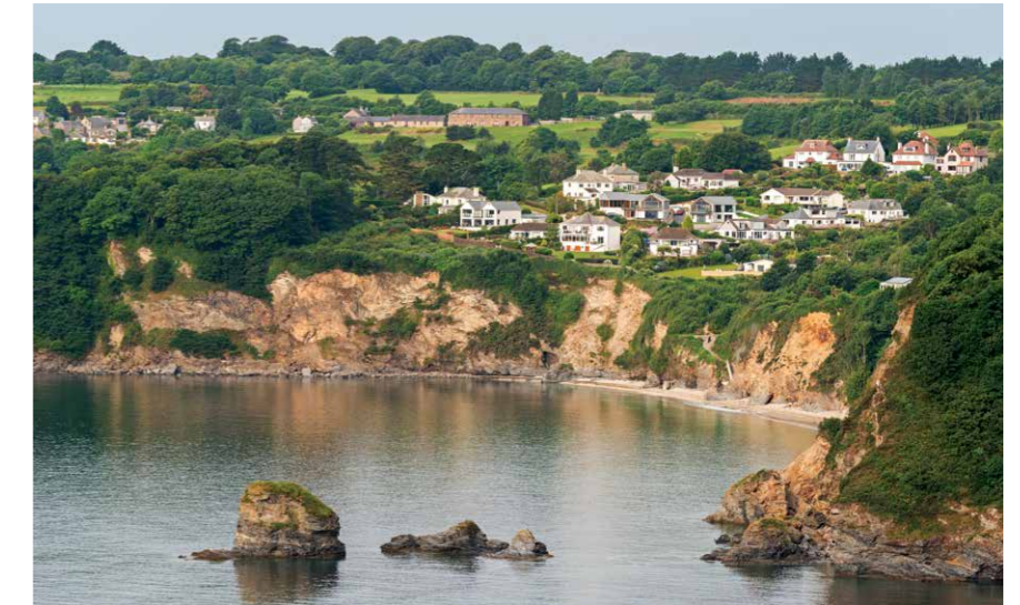
LEFT & ABOVE Charlestown & local coastline

St Austell Bay includes several stunning beaches and stretches of rugged coastline, and the area is known as The Cornish Riviera.