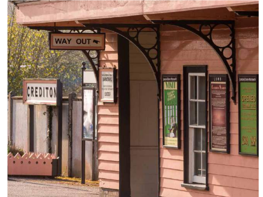
LEFT & ABOVE The Tarka Line Crediton Station

The nearby Tarka Line is one of Britain's most scenic railways, linking Exeter with the North Devon coast at Barnstaple. Exeter St Davids is only 2 stops from Crediton station and provides easy connections to London, Bristol and Plymouth.