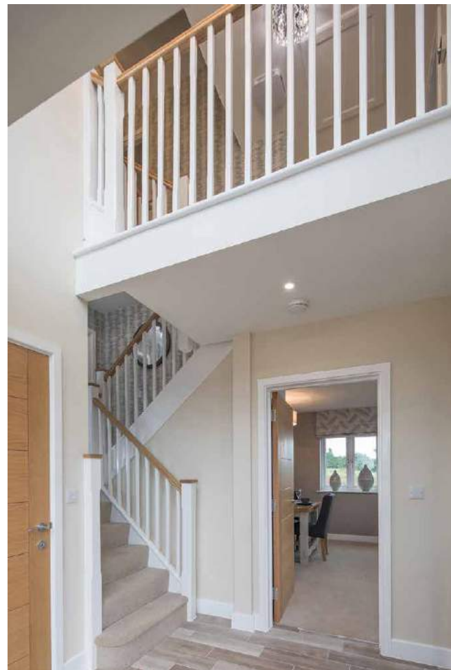
LEFT Morchard & Copplestone