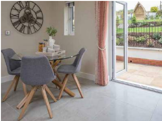
ABOVE & RIGHT Morchar show home interior