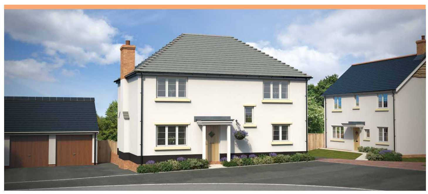
CGI shows plot 43