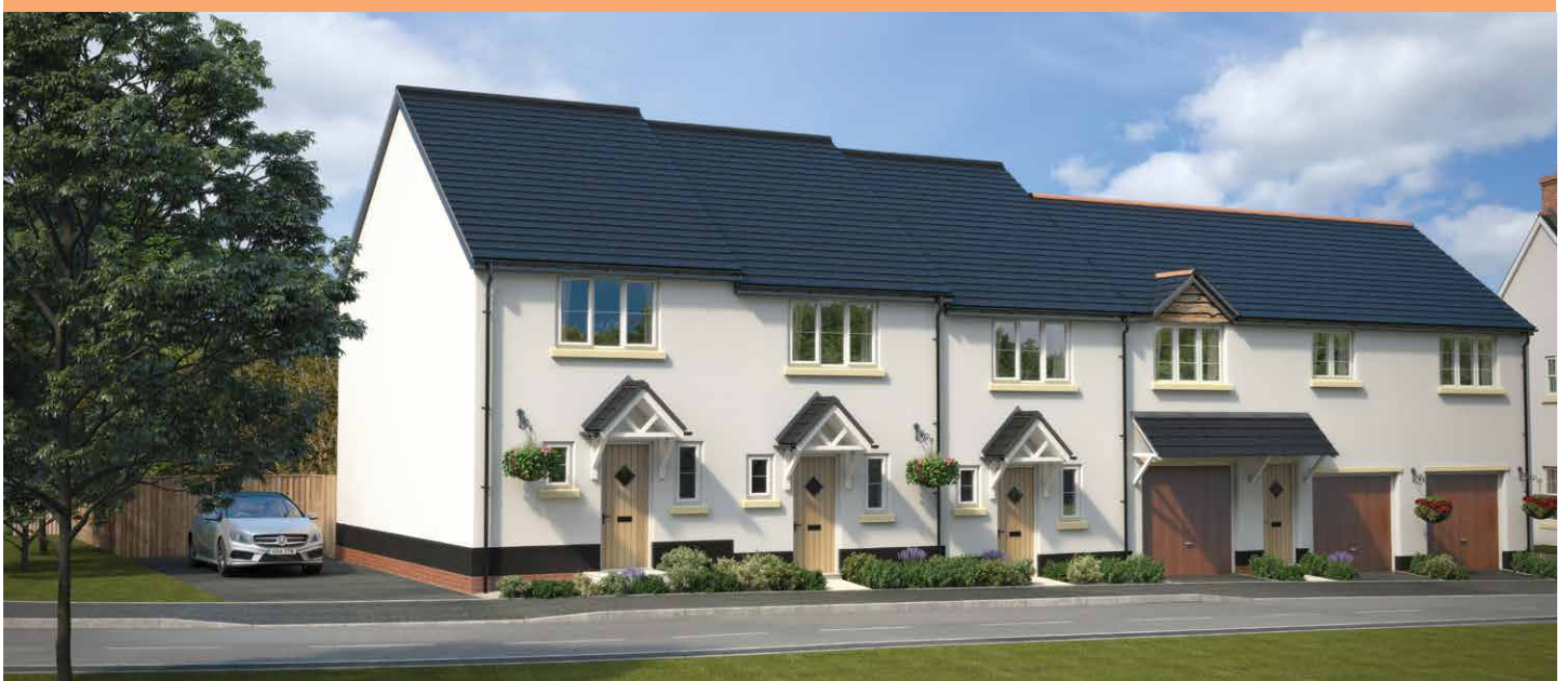
CGI shows plots 67 – 69