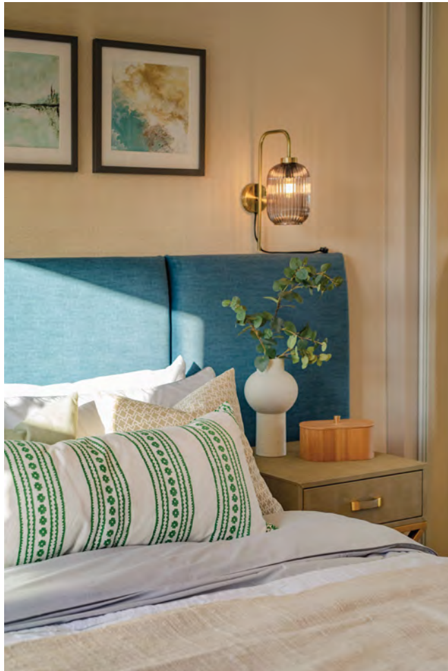
ABOVE & RIGHT Modbury house type interiors