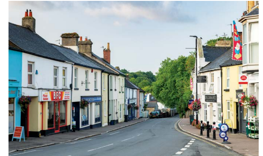
LEFT & ABOVE Haytor Rocks & Bovey Tracey High Street

The City of Exeter, with its historic cathedral and world-class shopping and dining, is only 15 miles from Bovey Tracey, and the beautiful South Devon coast is just 10 miles away.