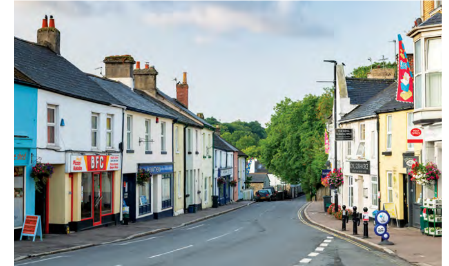
LEFT & ABOVE Haytor Rocks & Bovey Tracey High Street

The City of Exeter, with its historic cathedral and world-class shopping and dining, is only 15 miles from Bovey Tracey, and the beautiful South Devon coast is just 10 miles away.