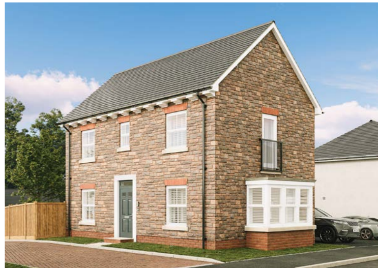
LEFT CGI of Parrett house type