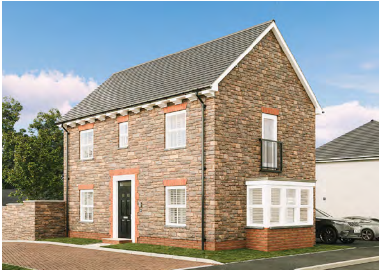
LEFT CGI of Parrett house type ABOVE CGI of Tone house type

Longston Cross takes its name from an old granite cross that stands beside the footpath that leads to Challabrook Farm. According to local legend it was used to mark the grave of a Royalist officer (called Longston) who was killed in the battle of Bovey Heath in 1646. It was here that Cromwell's troops defeated the Royalists in what was a regionally decisive battle during the English Civil War.