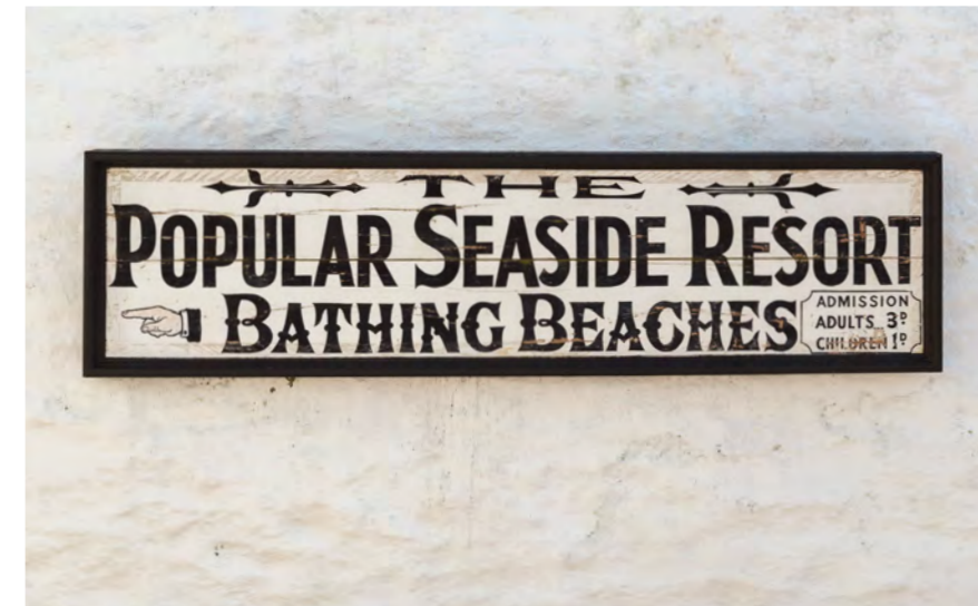
LEFT & ABOVE Toposcope at The Torrs & sign directing to Tunnels Beaches, popularised in the Victorian era

A large part of North Devon's coastline is a designated National Landscape to protect its diverse habitats and scenery, which ranges from rugged cliffs and sheltered coves to long stretches of dune-backed beaches.