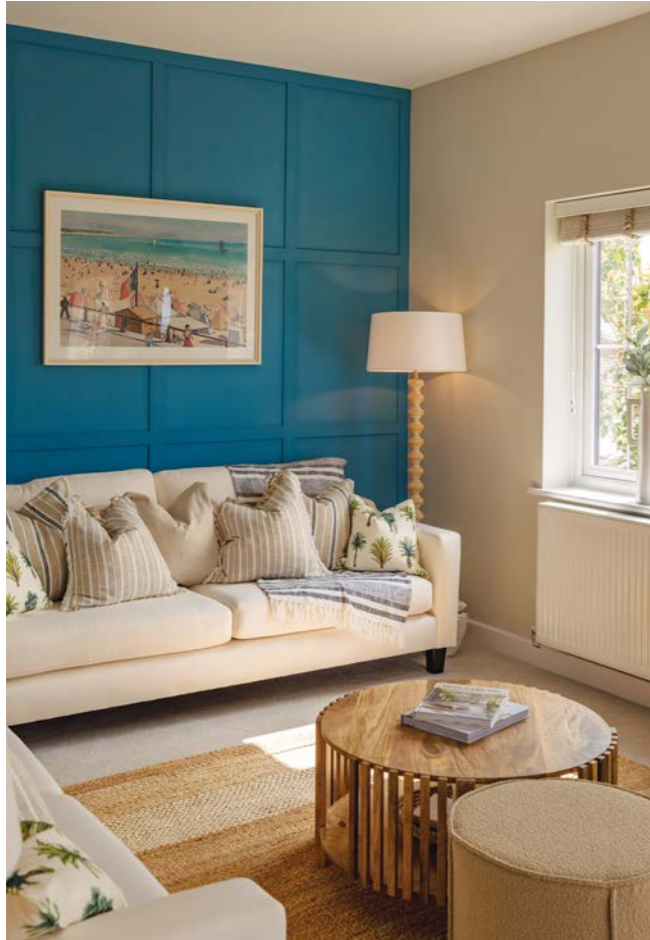
ABOVE & RIGHT Torrige house type interiors