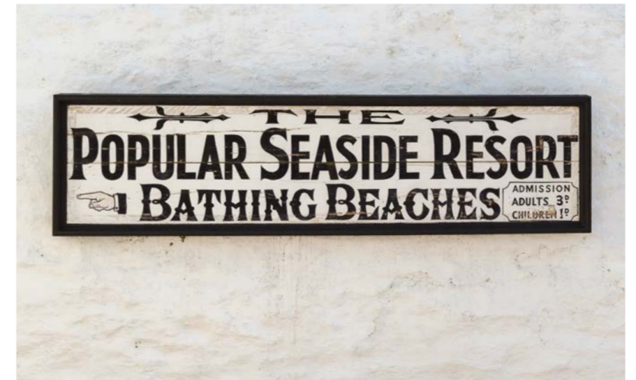
LEFT & ABOVE Toposcope at The Torrs & sign directing to Tunnels Beaches, popularised in the Victorian era

A large part of North Devon's coastline is a designated National Landscape to protect its diverse habitats and scenery, which ranges from rugged cliffs and sheltered coves to long stretches of dune-backed beaches.