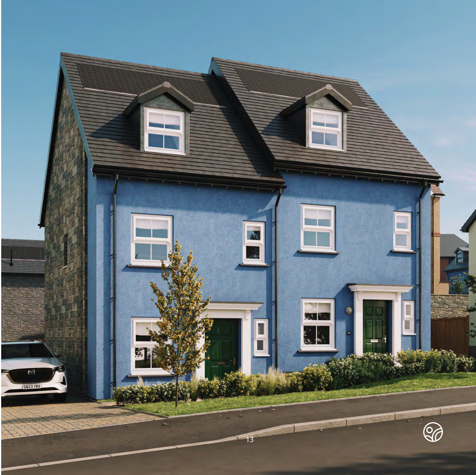
RIGHT CGI of Tamar (Formal style) house type