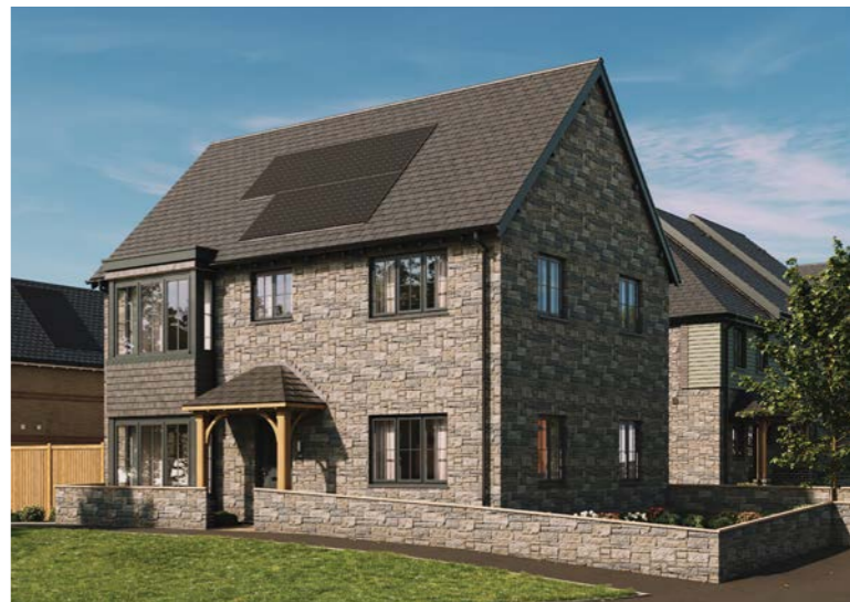
LEFT CGI of Bovey house type