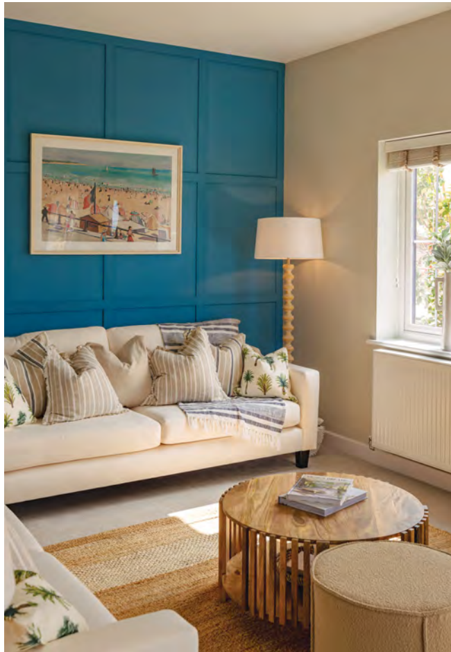
ABOVE & RIGHT Torrige house type interiors