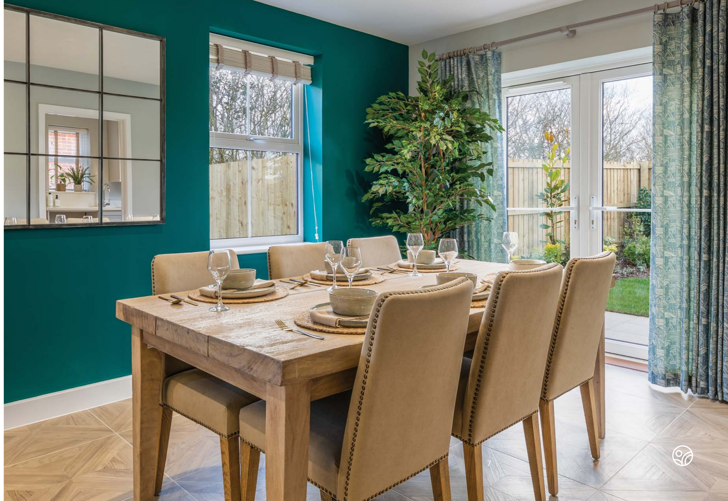
ABOVE & RIGHT Typical Devonshire Homes interiors — not site specific