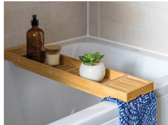
ABOVE Typical Devonshire Homes interiors (not site specific)