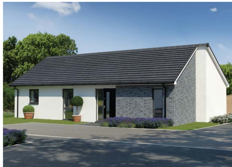
LEFT Saunton ABOVE Wembury

Halwill Junction, as its name suggests, has a railway heritage. Once home to a station serving Halwill and Beaworthy, three lines diverged here; one to Bude, another to Torrington, and a third to Launceston and Padstow — which provided an important route through to London Waterloo.