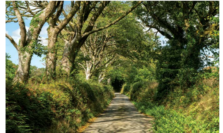
LEFT & ABOVE