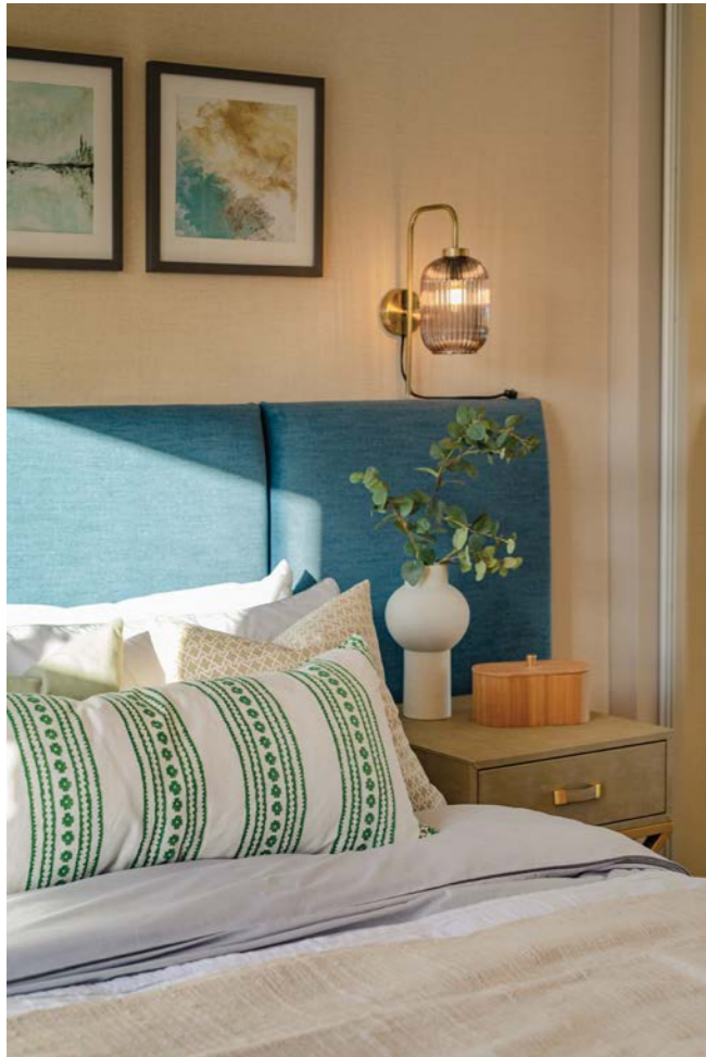
ABOVE & RIGHT Typical Devonshire Homes interiors — not site specific