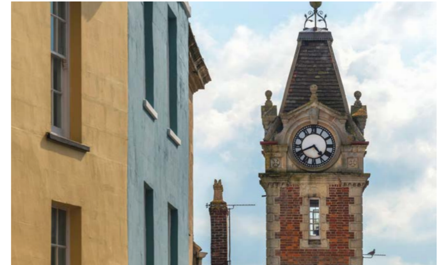
LEFT & ABOVE