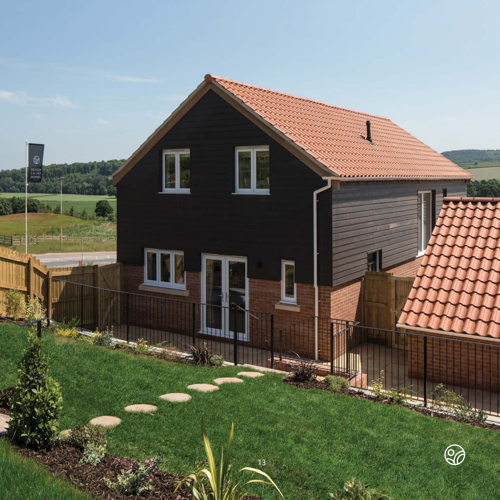
RIGHT Morchard at our Tarka View development in Crediton