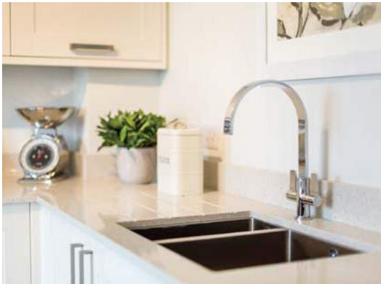
ABOVE Typical Devonshire Homes interiors (not site specific)