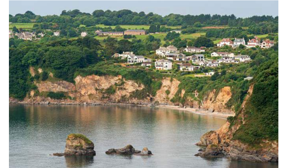
LEFT & ABOVE Charlestown & local coastline

St Austell Bay includes several stunning beaches and stretches of rugged coastline, and the area is known as The Cornish Riviera.