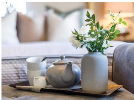
ABOVE & RIGHT Typical Devonshire Homes interiors — not site specific