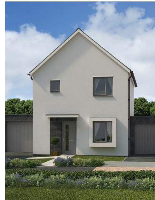
LEFT Gwallon and Sanderson