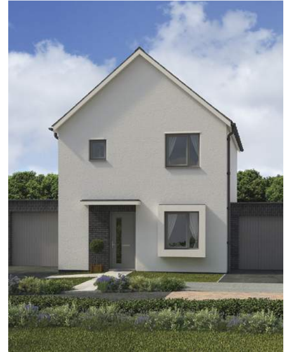
LEFT Gwallon and Sanderson