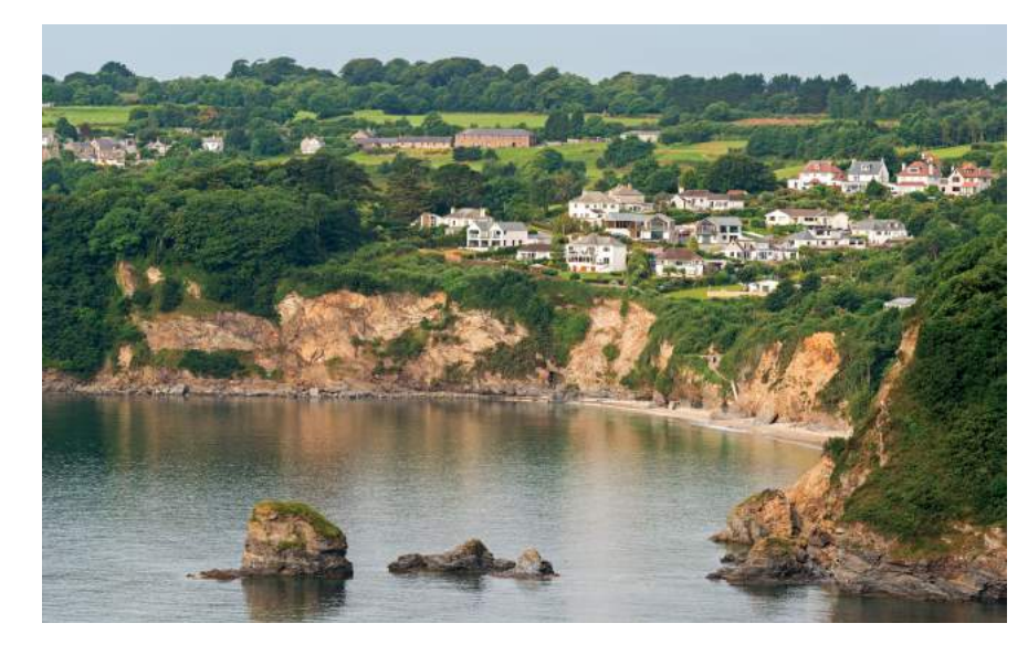
LEFT & ABOVE Charlestown & local coastline

St Austell Bay includes several stunning beaches and stretches of rugged coastline, and the area is known as The Cornish Riviera.