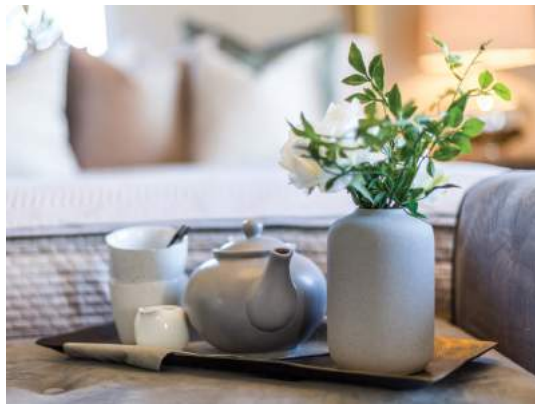
ABOVE & RIGHT Typical Devonshire Homes interiors — not site specific