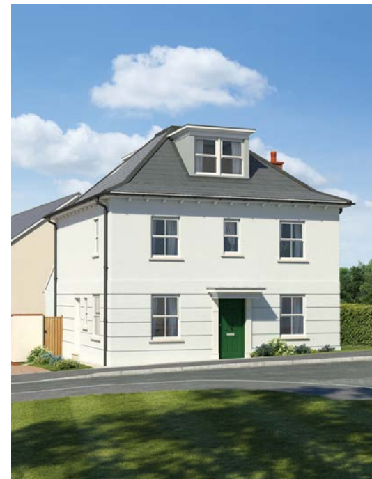
LEFT Modbury ABOVE Killerton

Longston Cross takes its name from an old granite cross that stands beside the footpath that leads to Challabrook Farm. According to local legend it was used to mark the grave of a Royalist officer (called Longston) who was killed in the battle of Bovey Heath in 1646. It was here that Cromwell's troops defeated the Royalists in what was a regionally decisive battle during the English Civil War.