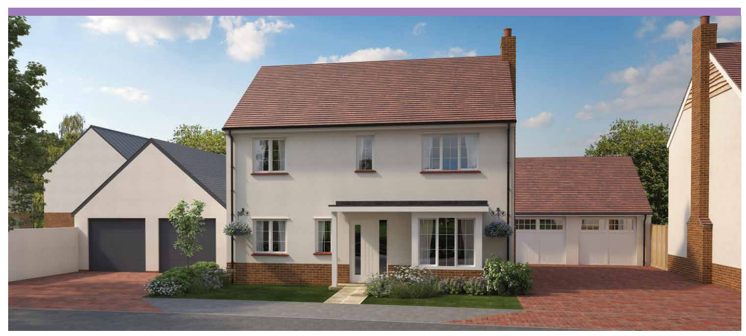
Typical CGI, not site specific.