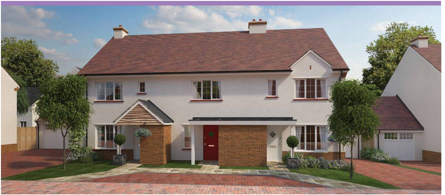
Typical CGI, not site specific.