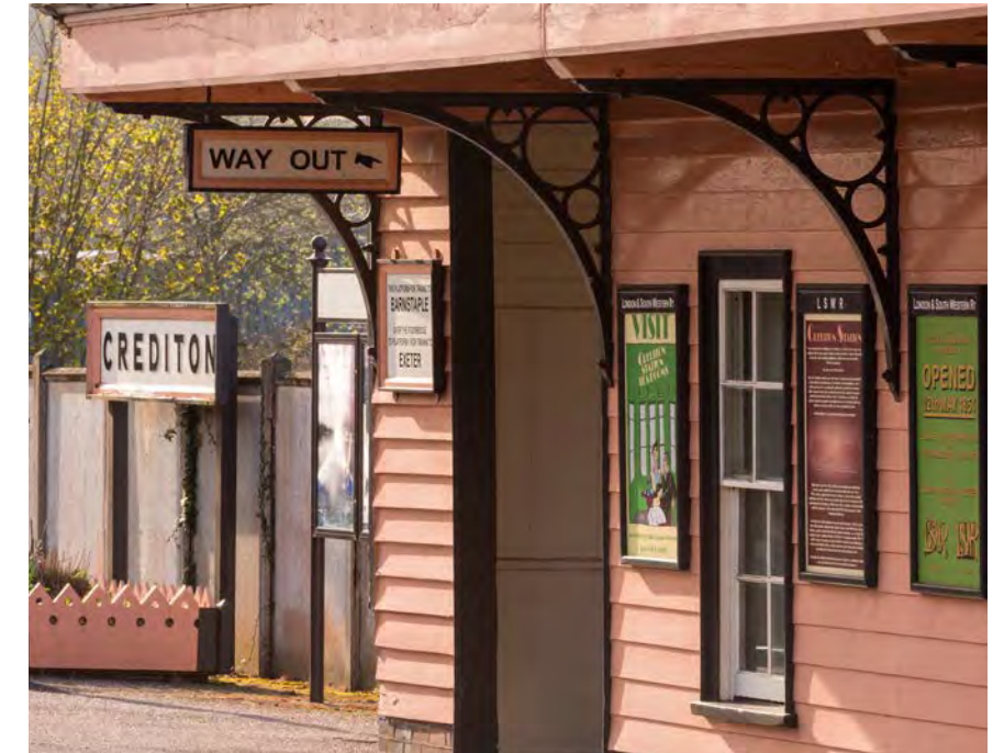
LEFT & ABOVE The Tarka Line Crediton Station

The nearby Tarka Line is one of Britain's most scenic railways, linking Exeter with the North Devon coast at Barnstaple. Exeter St Davids is only 2 stops from Crediton station and provides easy connections to London, Bristol and Plymouth.