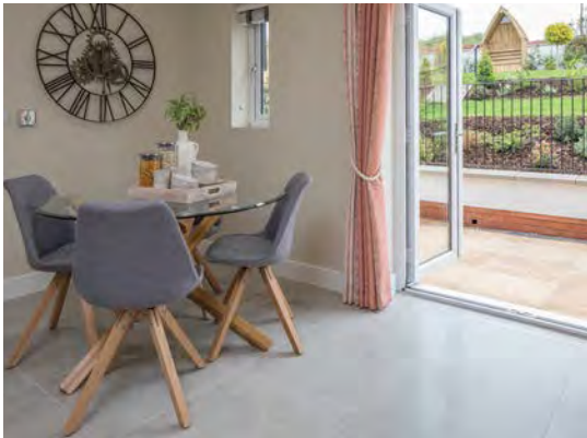
ABOVE & RIGHT Morchard show home interior