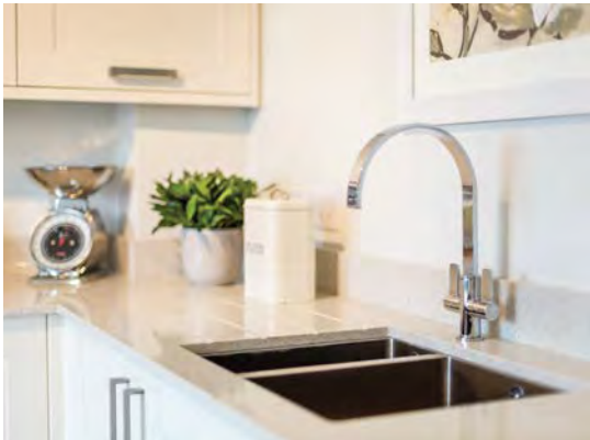
ABOVE Typical Devonshire Homes interiors (not site specific)