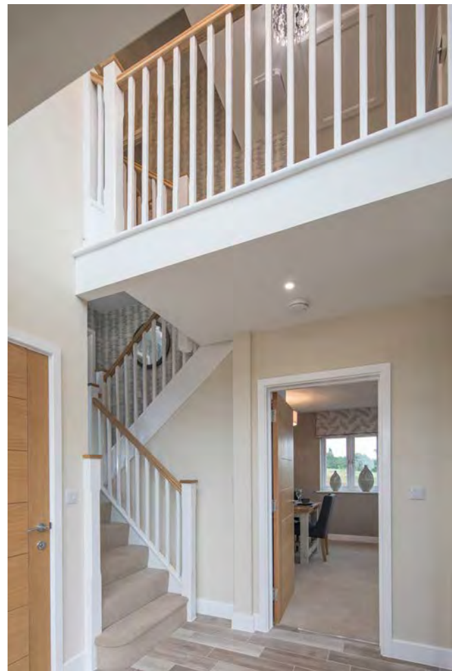
LEFT Morchard & Copplestone