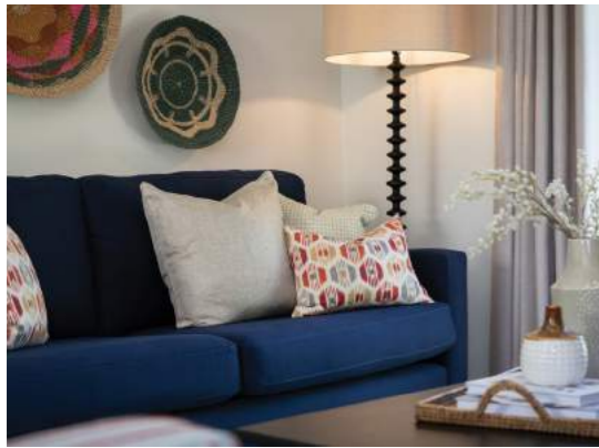
ABOVE & RIGHT Typical Devonshire Homes interiors — not site specific