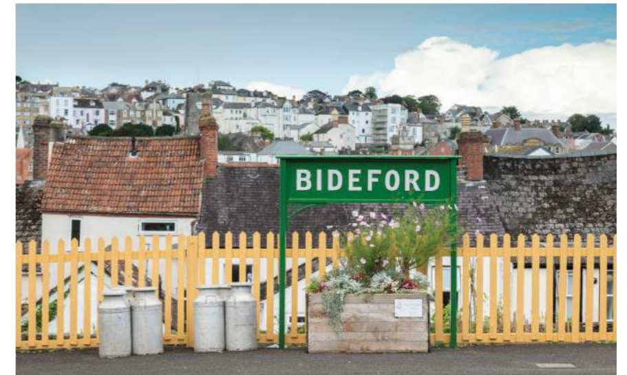
LEFT & ABOVE