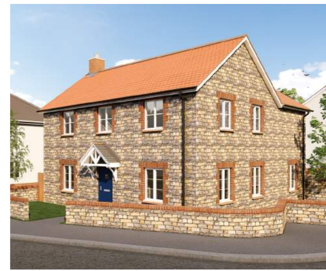
LEFT Bicton Formal & Bideford Formal