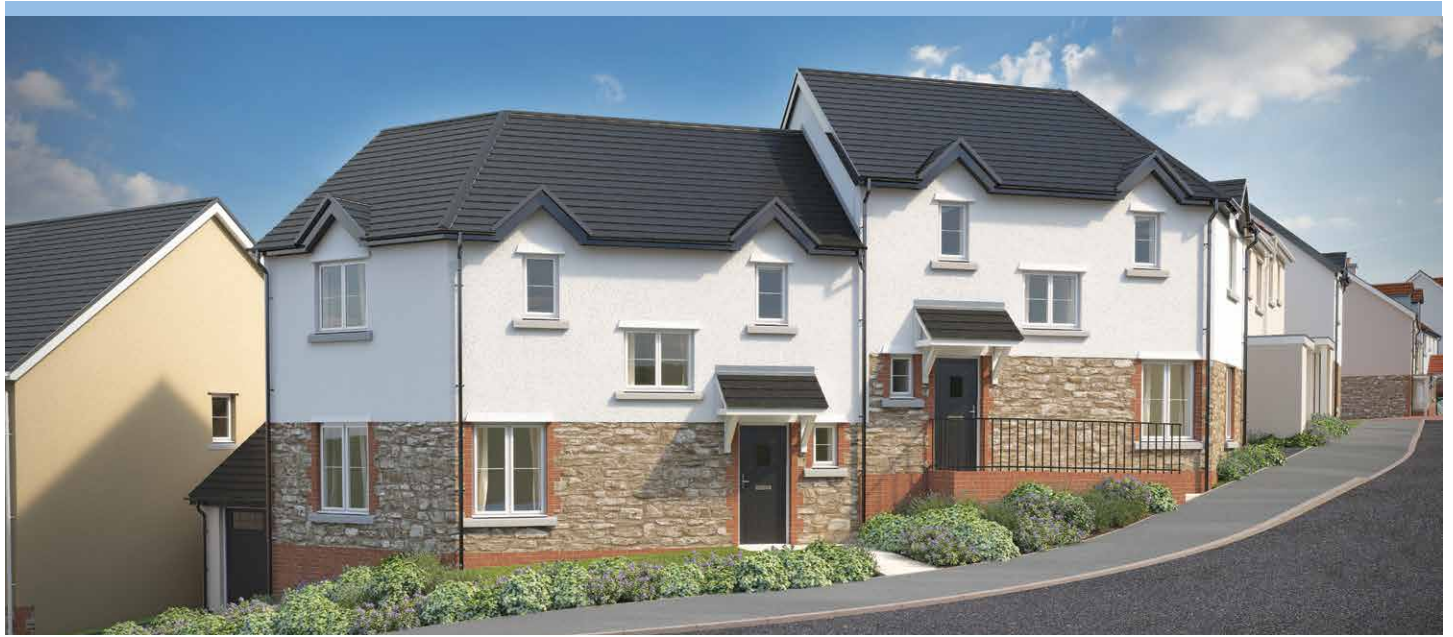
Typical CGI, not site specific.