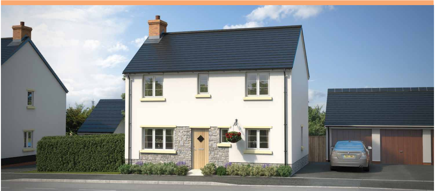
CGI shows plot 44