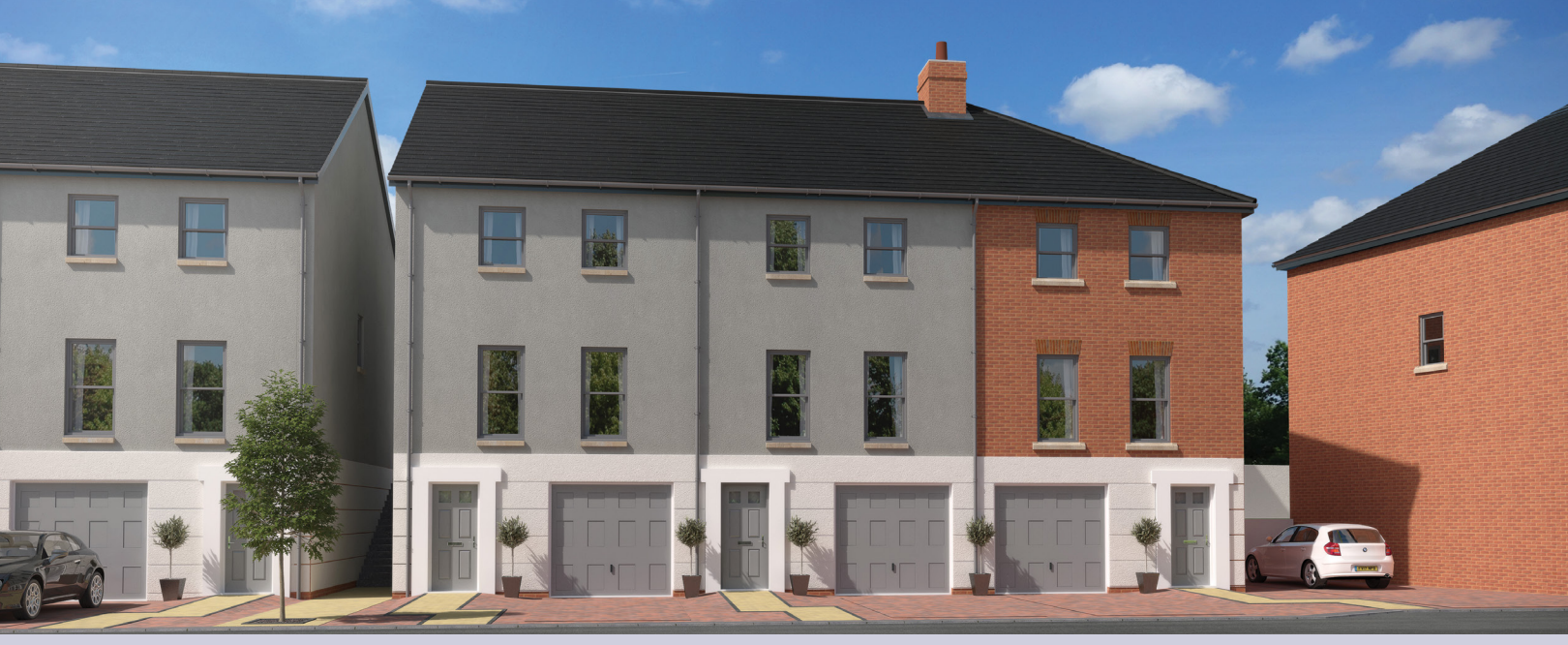
CGI shows plots 61-63