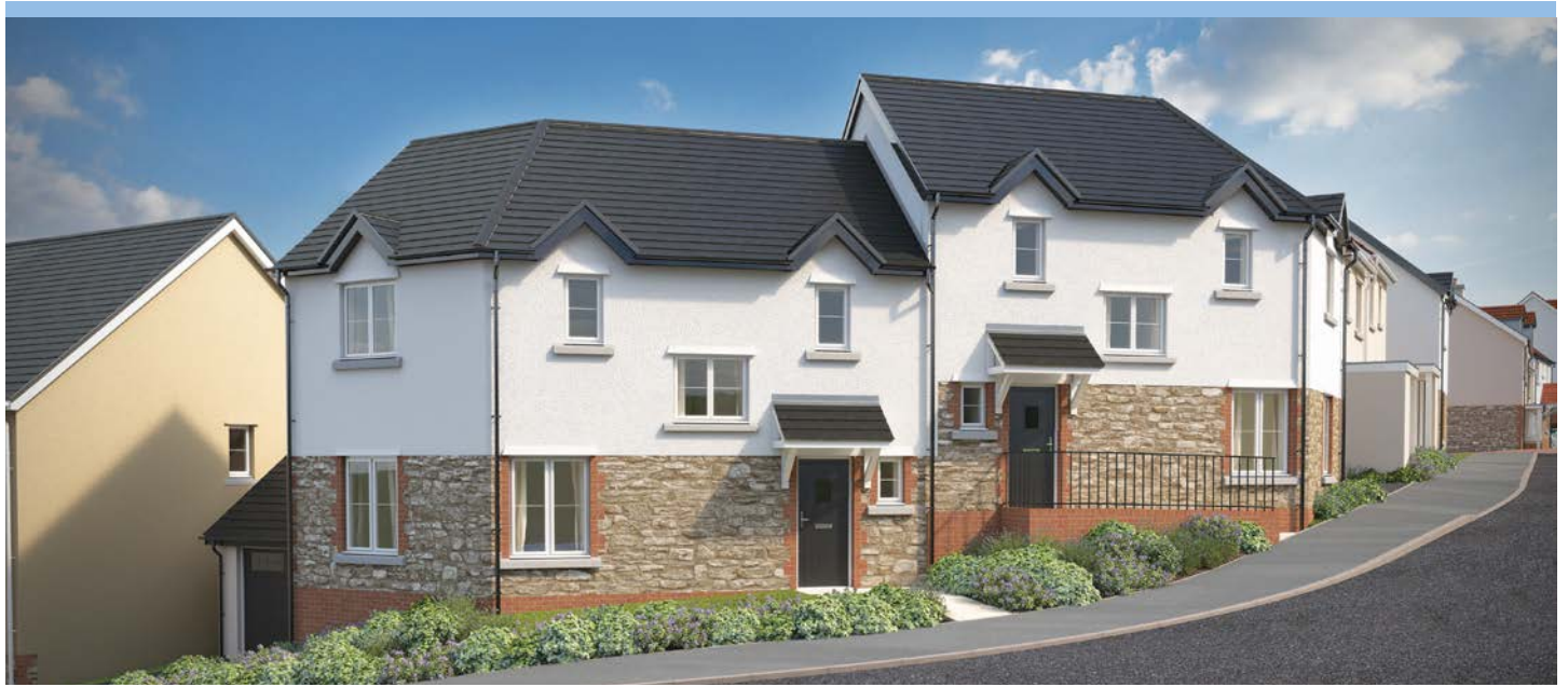
Typical CGI, not site specific.