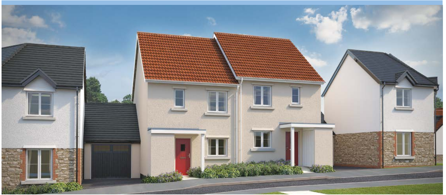
Typical CGI, not site specific.