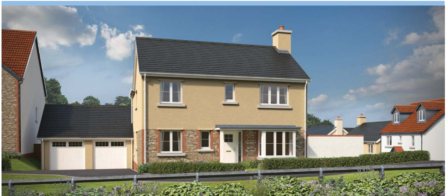
Typical CGI, not site specific.